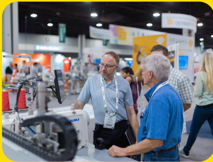
*Demographics from Texprocess Americas 2018 Survey